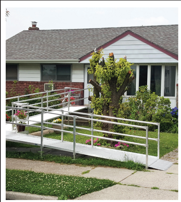
Handicapped ramp that was installed through the Town's Community Development Block Grant Program.

Town of Oyster Bay Department of Intergovernmental Affairs,