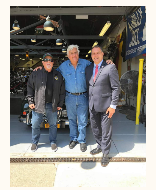
The set of Jay Leno's Garage (2019) △ 20th Century Cycles in Oyster Bay

Search Party (2020): Tides Motor Inn, Bayville What's Eating America with Andrew Zimmern (2020): A&S Pork Store, Massapequa